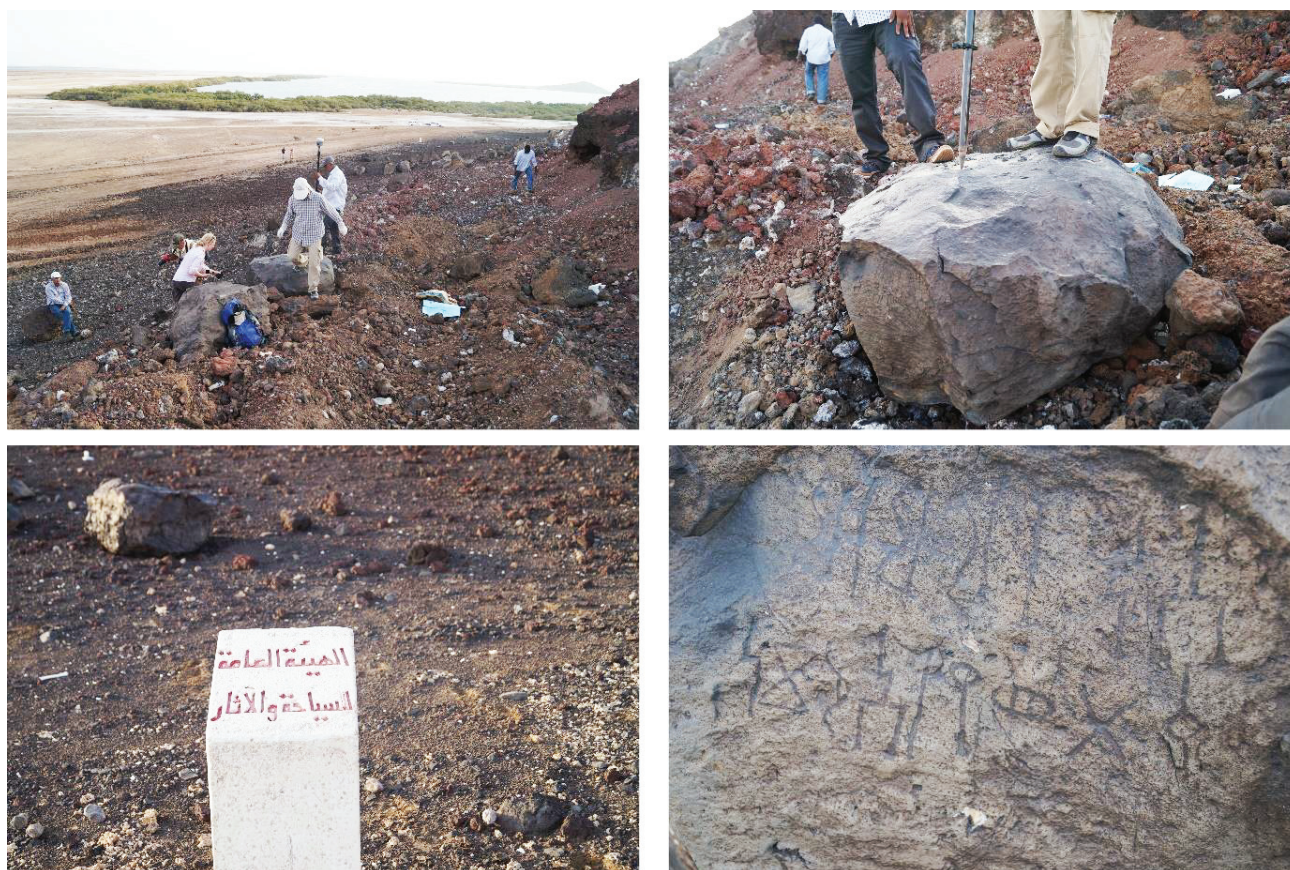
Figure 19. Boulders with south Arabic scripts were found on the eastern slope of the cinder cone.

The archaeological data provide insights into the potential significance of coastal environments and marine resources to the Stone Age populations that lived in the region over the same time range. The data were collected from 13 locations along the 100 km coastline adjacent to the volcanic province of the Harrat Al Birk in the provinces of Asir and Jizan, and from three areas in the Farasan Islands: the north of Farasan al Kabir, the headland of Ras Sheida in the south of Farasan al Kabir, and the Sulayn and Abalat group of islands. All locations and features were photographed, and their positions and elevations were measured with DGPS equipment. Over 70 samples for dating were collected for Uranium series, Argon-Argon and Amino Acid Racemization analysis. The data on the archaeological features or artefacts were recorded in situ. The Al Birk coastal features lie in the range of 3–8 m above the modern sea level, which is consistent with the elevation of the features, dated elsewhere in the Red Sea region, to the last interglacial high sea-level stand at c. 130,000 ka. The features of the Farasan Island have much more variable elevations due to the locally variable effects of salt doming. The archaeological features mostly comprise shell middens that are known to be of mid-Holocene age based on radiocarbon determinations. These cannot be used to date the underlying coral terraces or other geological formations, which may precede the middens by an