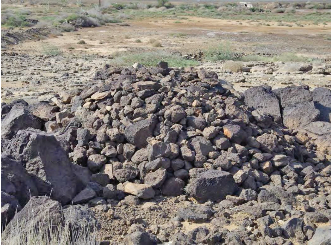
Figure 6. A stone mound south of Al Qamah in the Harrat Al Birk, resting on a Pleistocene terrace, which is now located several kilometers from the present shoreline. More than a dozen of these mounds are present in this location and were built for human burials.