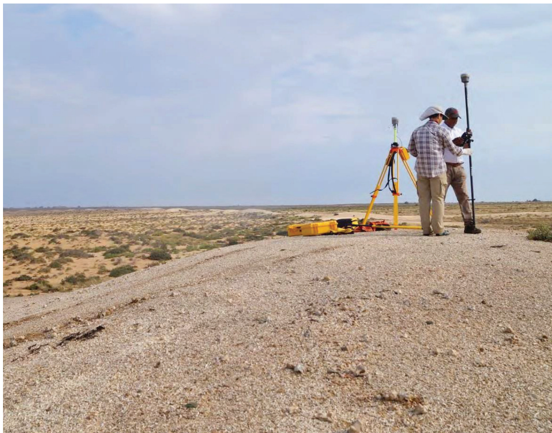
Figure 2. Series of shell mounds in the Janaba Bay, Farasan Kabir, showing a large mound in the foreground with the GPS measuring equipment used in the survey. Similar shell mounds are visible in the middle distance along the edge of a palaeoshoreline that is now ~1 km inland from the modern shoreline (visible on the far left).

The Saudi Geological Survey began a field program to study the uplifted Late Pleistocene coral terraces in December 2013. The purpose of this project is to document the relative sea-level changes along the coastlines of the country and, from this, to infer the magnitudes of the recent tectonic uplift or subsidence that occurred in the area. It is also intended to document the Late Pleistocene paleo-environments and the distribution of reefs through time. The first phase of