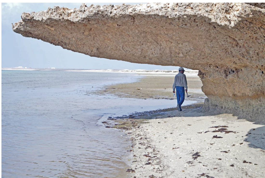
Figure 14. The Farasan 3-m coral terrace, showing the degree of undercutting by marine erosion.