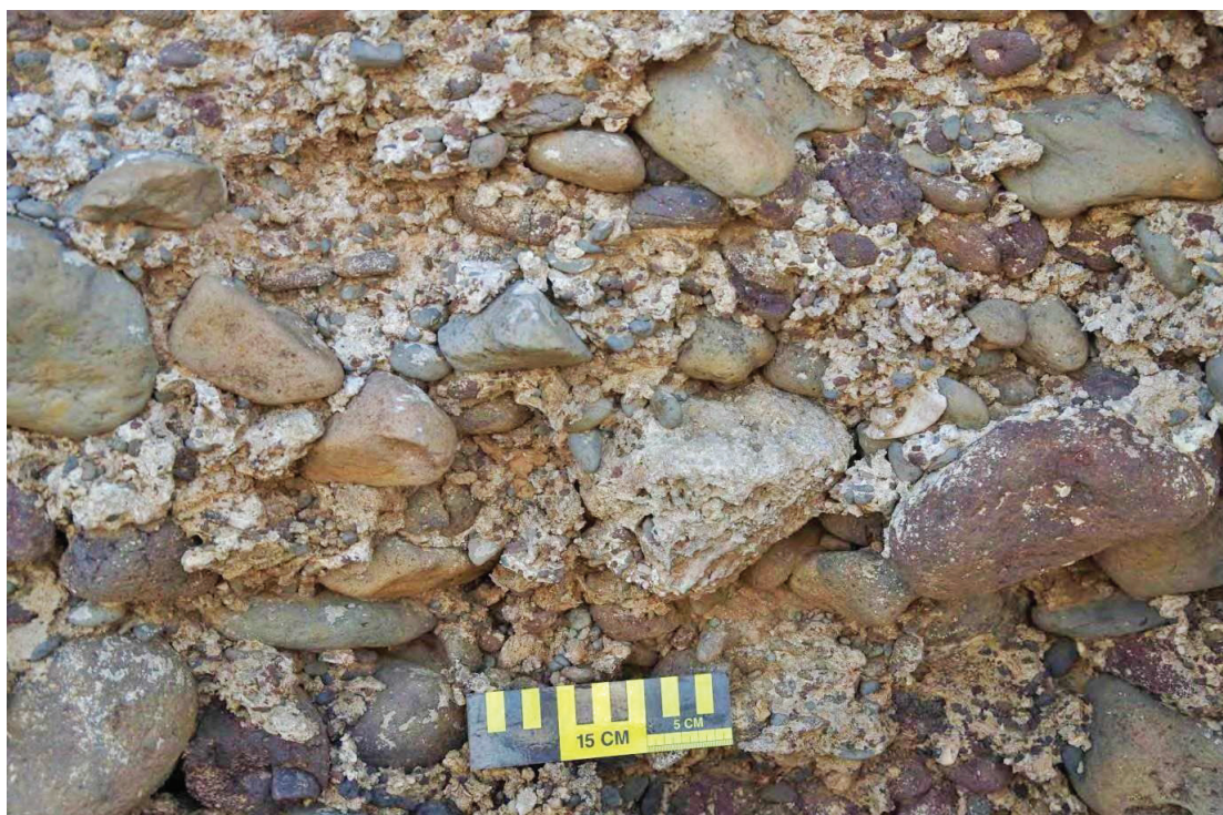
Figure 15. Unit 2, comprising a debris flow conglomerate within the wadi, cutting through the Dhahaban quarry. The clasts include cobbles of both the basalt and the Pleistocene corals that crop out in other parts of the quarry. Stone artefacts were also recovered from this same deposit (see Fig. 16).

A number of localities were visited in the Al Birk region. These include the shell midden site to the north of Al Birk town, which were visited and sampled during the previous archaeological surveys (Fig. 17). The site is of particular interest, because it comprises a cemented coral terrace, most likely of last interglacial date, that is situated immediately behind the modern beach with Middle Stone Age artefacts on its surface and probably of similar age (Inglis and others, 2014b), and a scatter of food shells that were dated to be 5,560 \pm 70 BP (Beta-191460) using radiocarbon, which was an age obtained from one of the shells (Bailey and others, 2007; Alsharekh and Bailey 2013). In other words, the area is an archaeological palimpsest, comprising a mixture of materials of very different ages that cannot