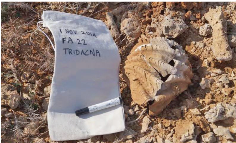
Figure 4. The Tridacna clam and the labelled bag.