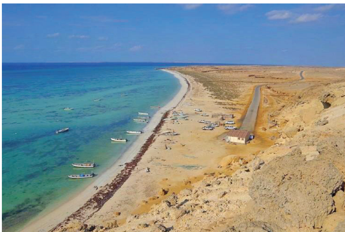
Figure 8. A fishing village in Mursa al Hesem on Farasan Kabir. This photograph was taken from the top of a coral terrace that was up-thrown relative to the plain below, with a topographic offset of about 30 m.

Below this highest terrace is a terrace, now tilted and with sinkholes, most probably formed by wave action acting on the minor faults or joint fractures in the bedrock, before the surface was uplifted (Fig. 12).