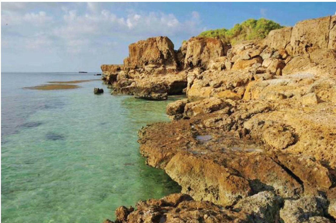
Figure 10. Massive coral reef section, capped by 9-m terrace in the large island within the Abalat group.