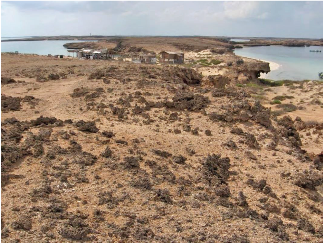
Figure 9. Coral terraces and small fishing village in the Murrabaah Island.