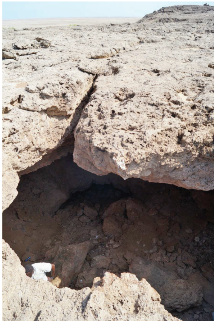
Figure 12. Upper terrace in Ras Shida, showing a sinkhole and a surface joint fracture.