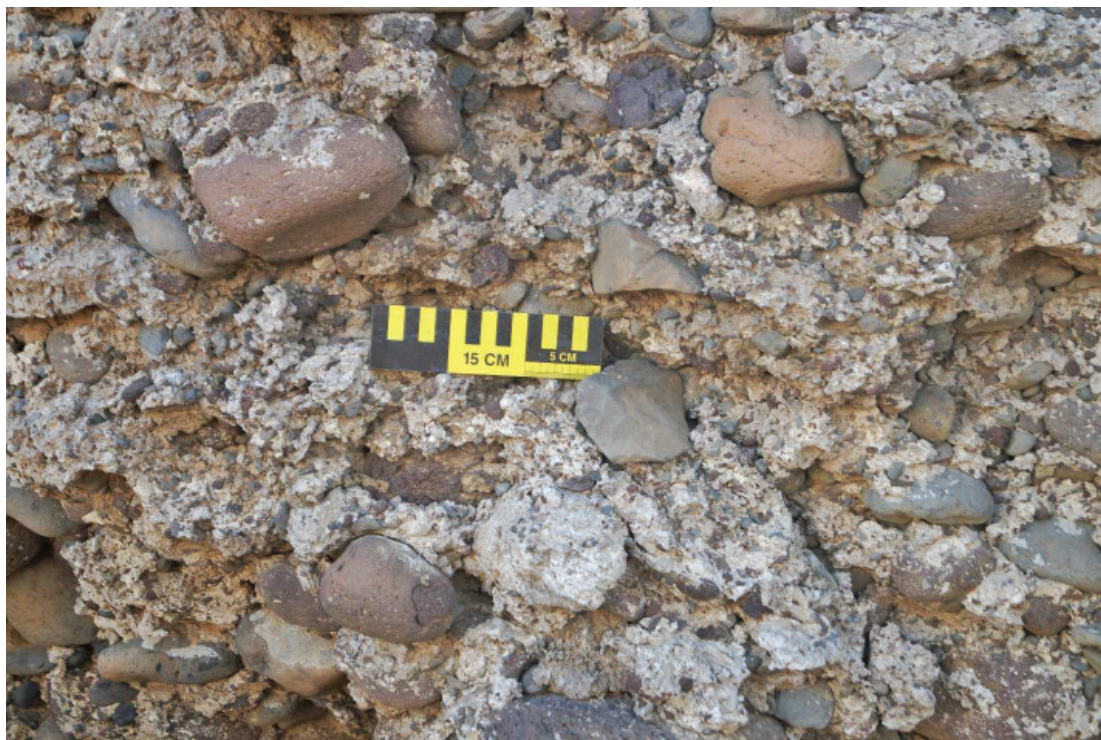
Figure 16. The debris flow in the Dhahaban quarry, showing two basalt artefacts embedded in the deposit (immediately to the right of the measuring scale).

Two other locations in the northern area of Al Birk town were sampled, one with a cemented coral deposit banked up against a volcanic lava flow on the west of the main road opposite a gas station, and a second locality in the eastern side of the main road and further south, where a coral beachrock deposit is exposed, with a single