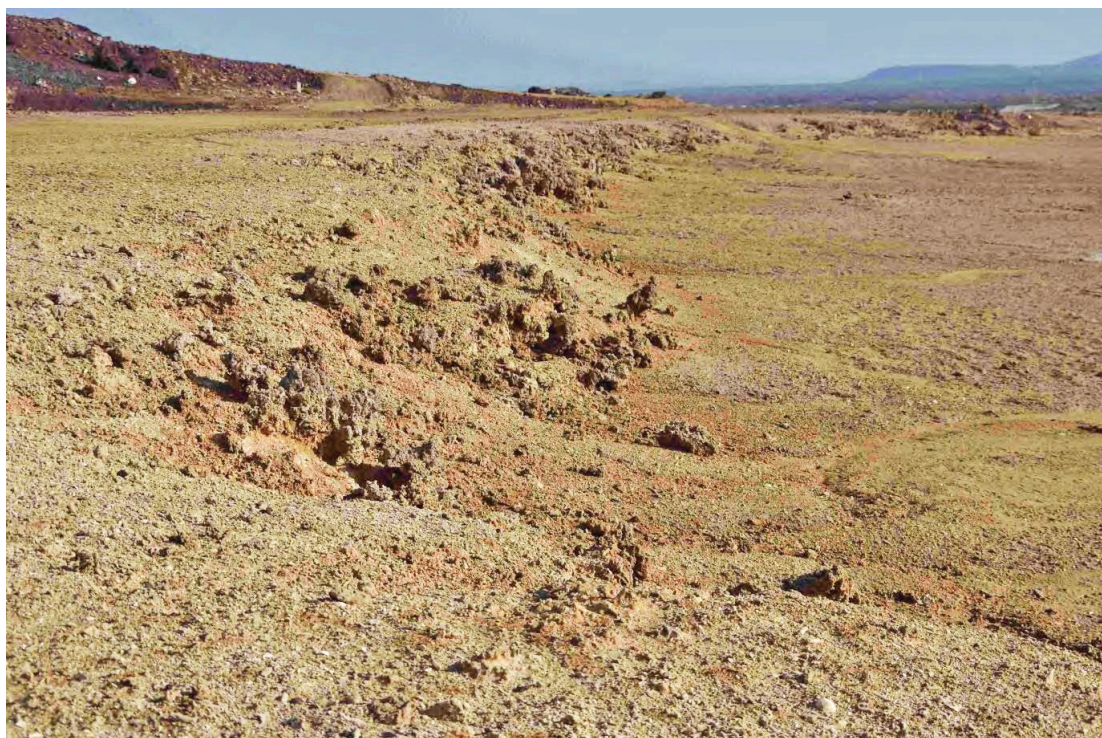
Figure 18. Extensive coral terrace that was banked up against a volcanic cinder cone on the east side of the coast guard radar station south of Al Birk. The corals in this location are very highly altered and generally unsuitable for U-series age dating.

struck basalt flake recovered from within the beachrock deposit.