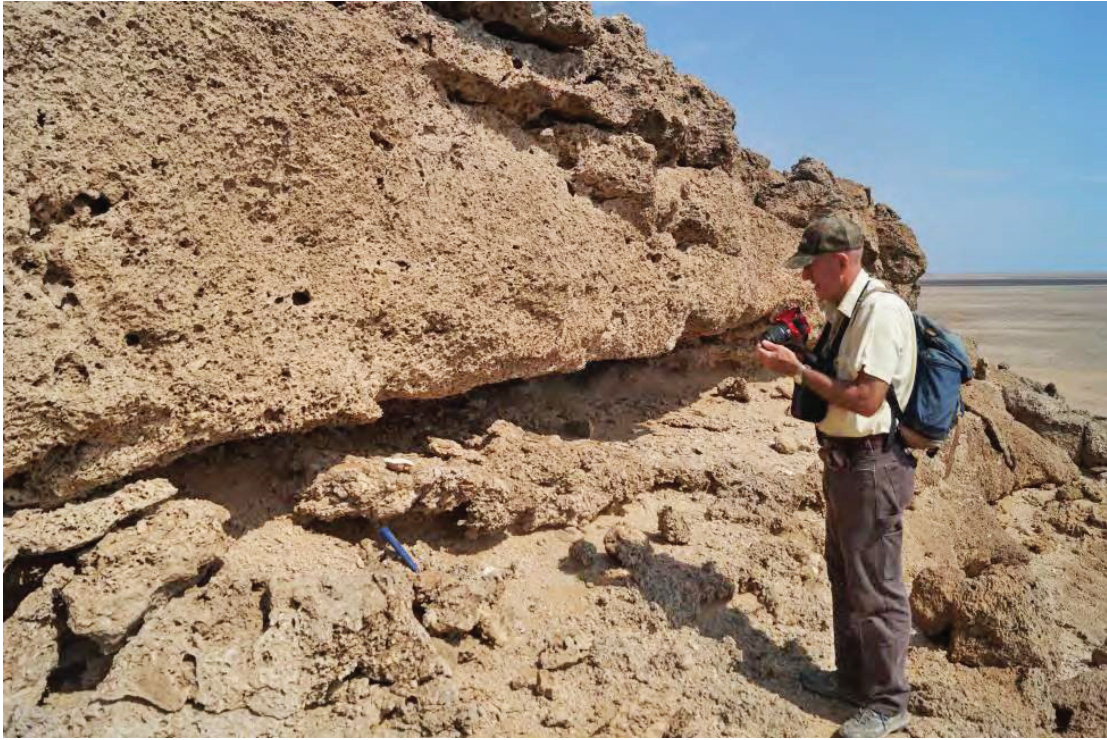
Figure 11. The highest coral terrace in Ras Shida.