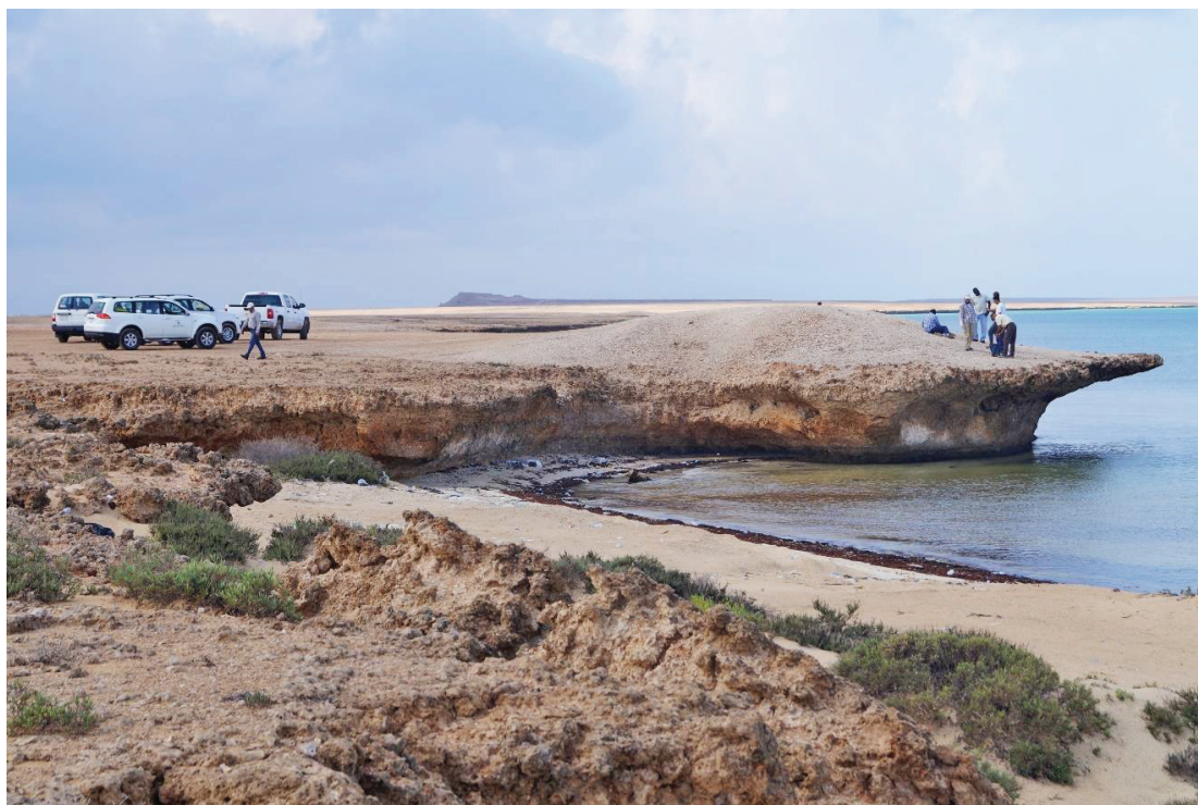
Figure 13. Shell mound of mid-Holocene, age sitting on the 3-m terrace, with the Ras Shida headland visible from a far distance. The edge of the coral terrace was undercut by marine erosion.

edge of this coral terrace yielded radiocarbon age dates in the range of 6,000–4,000 cal BP, but this can only be interpreted as a minimum age for the underlying terrace, which could be very much older. The preliminary height measurements suggest that this lower terrace has variable elevations along its length, suggesting the effect of a differential uplift/subsidence along this stretch of the coast (Figs. 13 and 14).