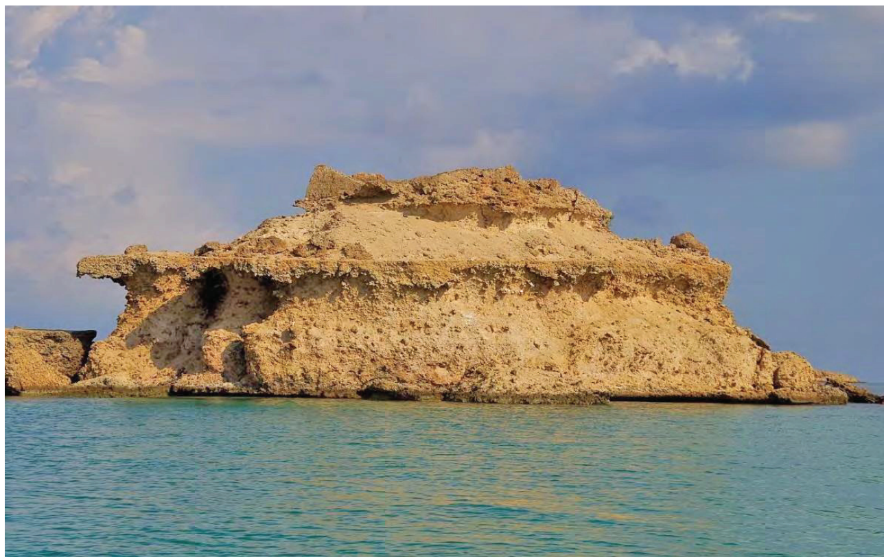
Figure 1. Multiple Late Pleistocene coral terraces in the Sulayn island group of the Farasan archipelago.

The geological changes in the region are likely to have major impacts on the preservation and the visibility of the archaeological evidence and on the varying attractiveness of the different areas of prehistoric human activities. Coastal uplift or subsidence and sea-level changes have also had major impacts on the visibility and preservation of coastal archaeological sites.