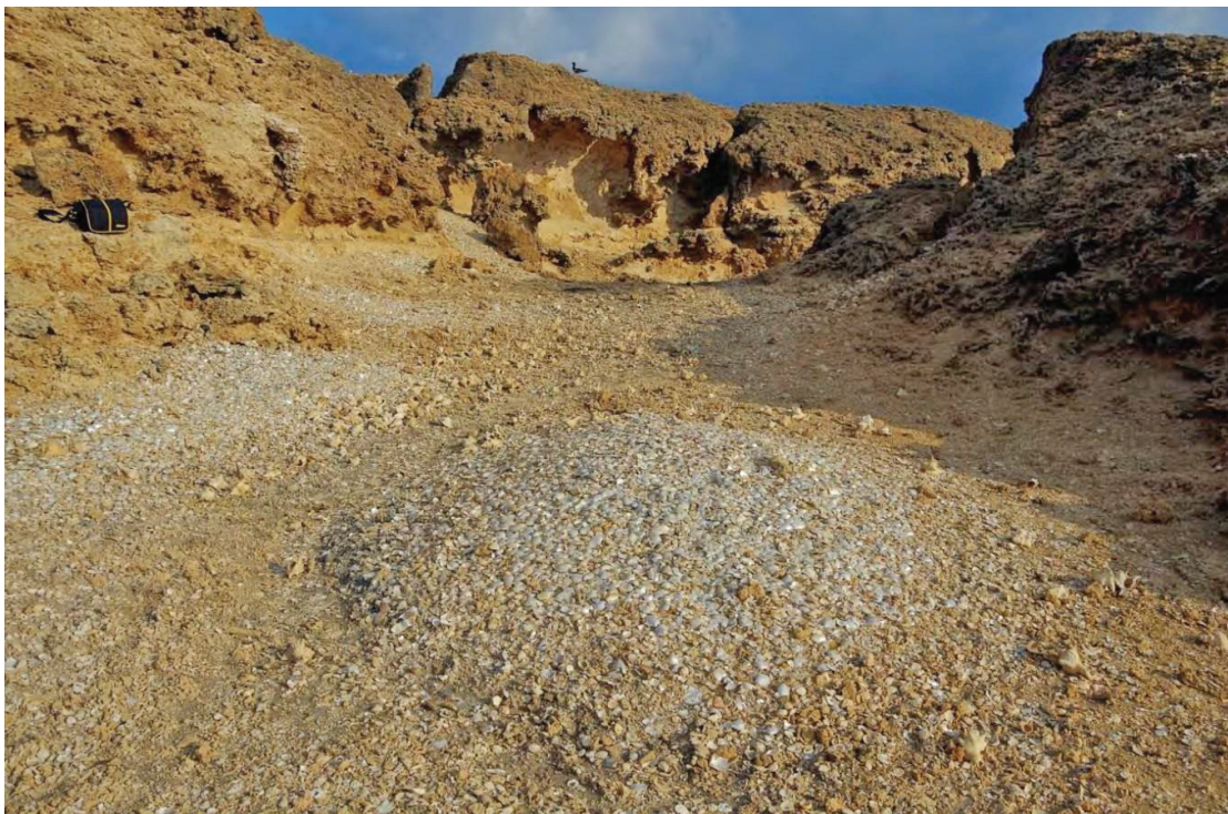
Figure 7. Shell midden located on one of the Abalat islands within the Farasan archipelago. The shells are predominantly pearl oysters and are associated with the remains of a nearby stone structure. This site probably represents a pearl fishermen's camp of relatively recent age.