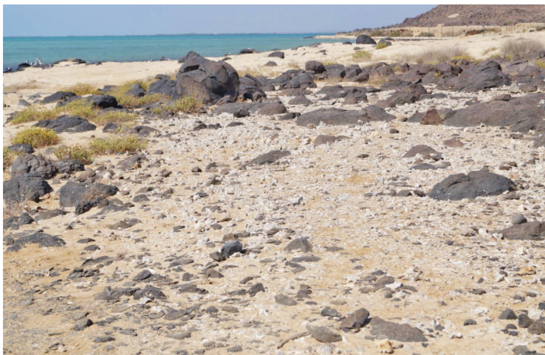
Figure 17. The shell midden at Al Birk. The midden comprises a relatively thin and superficial deposit, spread over quite a large area. The stone tools that were scattered across the surface are made from the local basalt and belong to a much earlier period than the shells. Large boulders of basalt are clearly visible around the edge of the area as can be seen in this image.