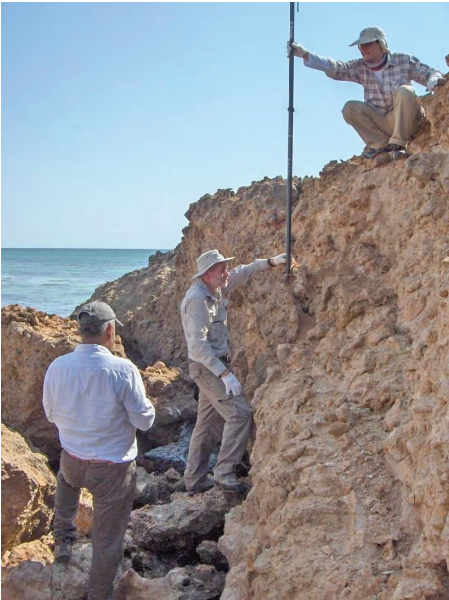
Figure 3. Sampling a Pleistocene coral terrace on Farasan Kabir west of Mursa al Hesen. Both corals and Tridacna clam shells (shown here) were sampled. Note the staff with a GPS receiver, mounted the sample, used for both precision measurement of position and elevation.